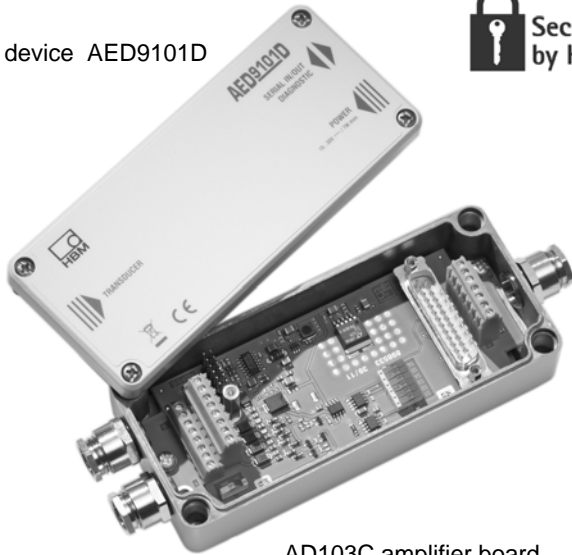
AD103C amplifier board